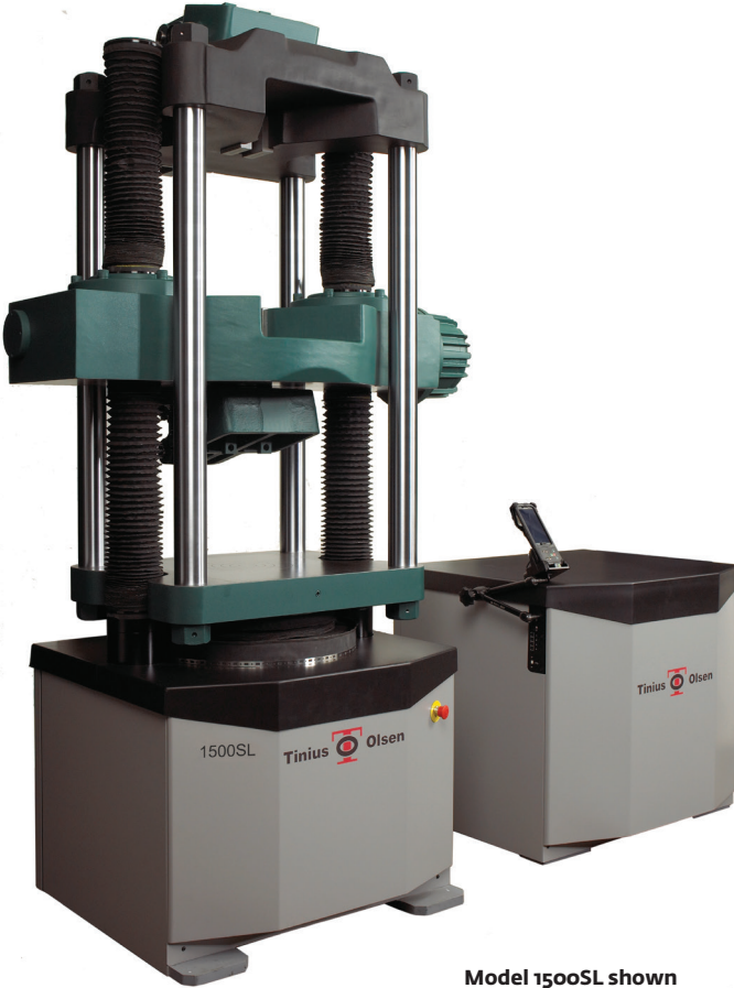
Model 1500SL shown